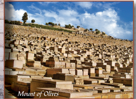
Mount of Olives