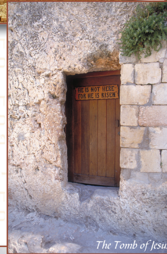
The Tomb of Jesus